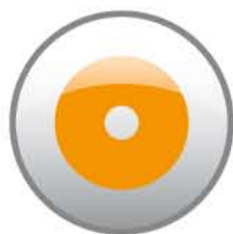
Twister Retail Orange - Intense cleaning