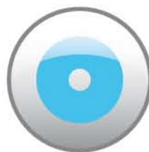
Twister Retail Blue - Daily cleaning

Download cleaning instructions and read more at www.htc-twister.com